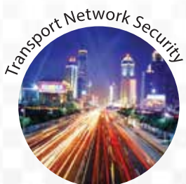
Transport Network Security