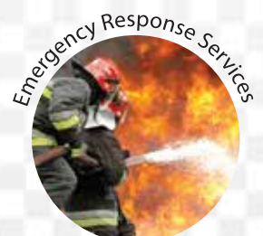
Emergency Response Services