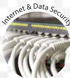
Internet & Data Security