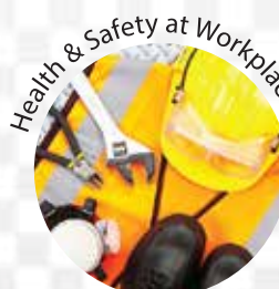
Health & Safety at Workplace