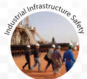
Industrial Infrastructure Safety