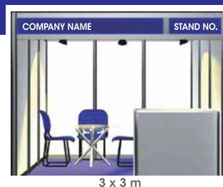
3 x 3 m

Note: 16% GST will be applicable on all rates.